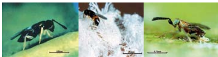
Figure 4. Tetracnemoidea brevicornis , Coccophagus gurneyi and Anagyrus fusciventris ; mealybug parasitoids.

Natural enemies of mealybugs in this vineyard include three very small wasps (Fig. 4). They are capable of parasitising significant numbers of mealybugs, but are vulnerable to damage by organophosphate insecticides and to ant attack.