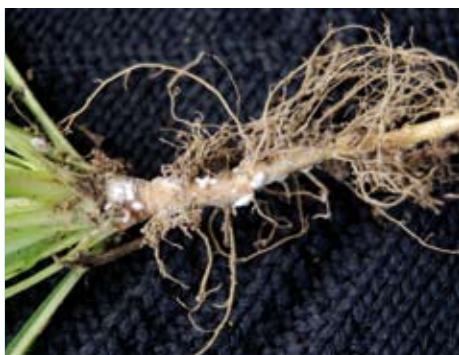
Figure 1. Mealybugs on hawksbeard taproot.

In the CJ Pask Gimblett Road vineyard, mealybugs live predominantly on the roots of broadleaf plants (e.g. hawksbeard, white and subterranean clovers, dovesfoot, and willow-herb) (Fig. 1) on the vineyard floor. It is difficult to remove clover species and willow-herb from the vineyard as underground stems survive herbicide control with glyphosate.