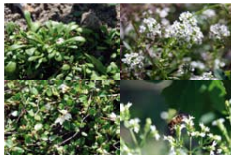
Figure 5. Clockwise from top left: creeping selliera, alyssum, oregano, pohuehue.

To maximise their longevity and fecundity, these parasitoids need food source plants in the vineyard. In an on-going trial, potential nectar source plants are being evaluated. The main difficulty encountered is weed competition. Vigorous species such as alyssum and oregano appear to be better suited in this vineyard than slower-growing native species (Fig. 5).