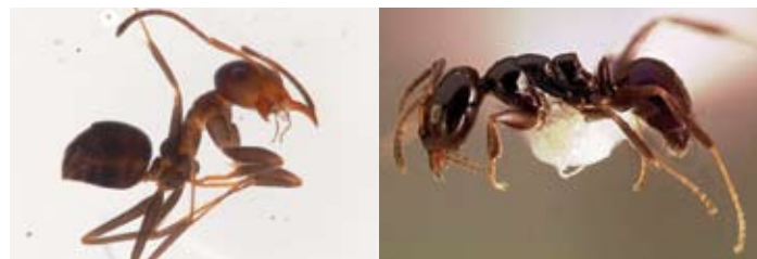
Figure 3. Iridomyrmex anceps and Ochetellus glaber : canopy ants.

Mealybugs produce honeydew, which attracts ants (Fig. 3). Ants "farm" mealybugs, and will defend them from attack by natural enemies.